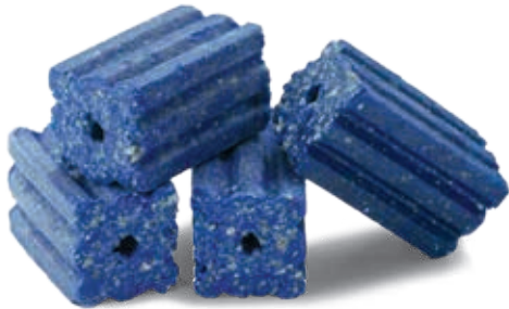
Photo may not be representative of a label-consistent bait placement