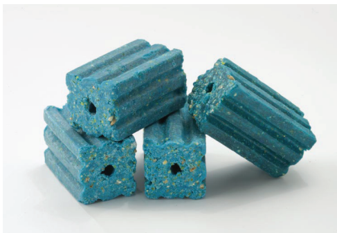
Picture not representative of Bait Placement. Bait stations are mandatory for outdoor, above ground use.