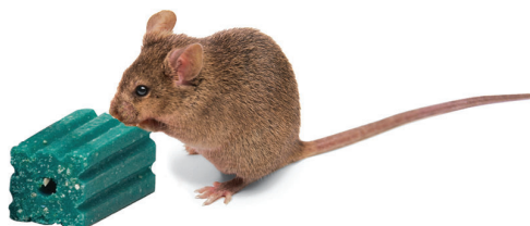
Picture not representative of Bait Placement. Bait stations are mandatory for outdoor, above ground use.