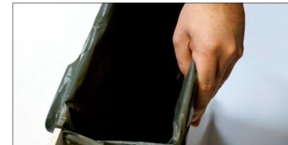
lift bin lid