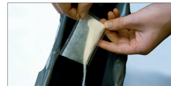
empty and drop in

Biosan P-max the next generation of natural germicides from the Biosan series